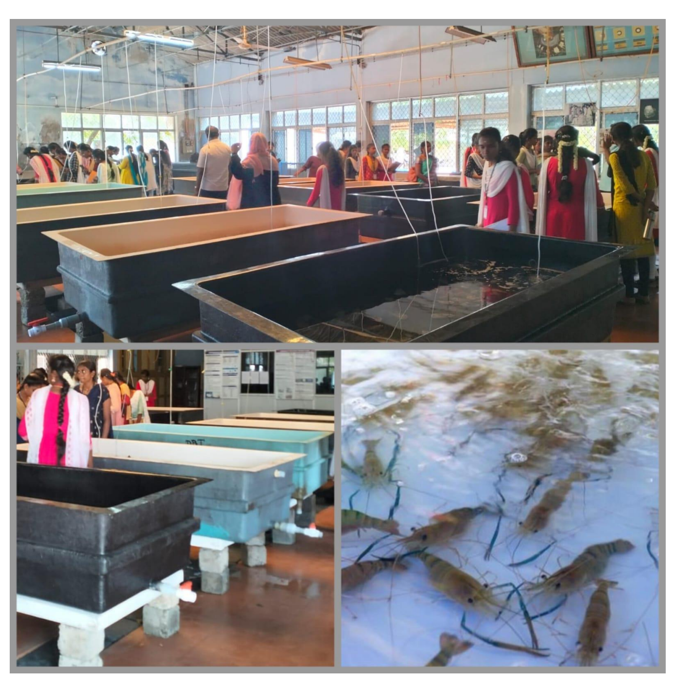
Oyster culture and prawn culture at CMFRI, Thoothukudi.