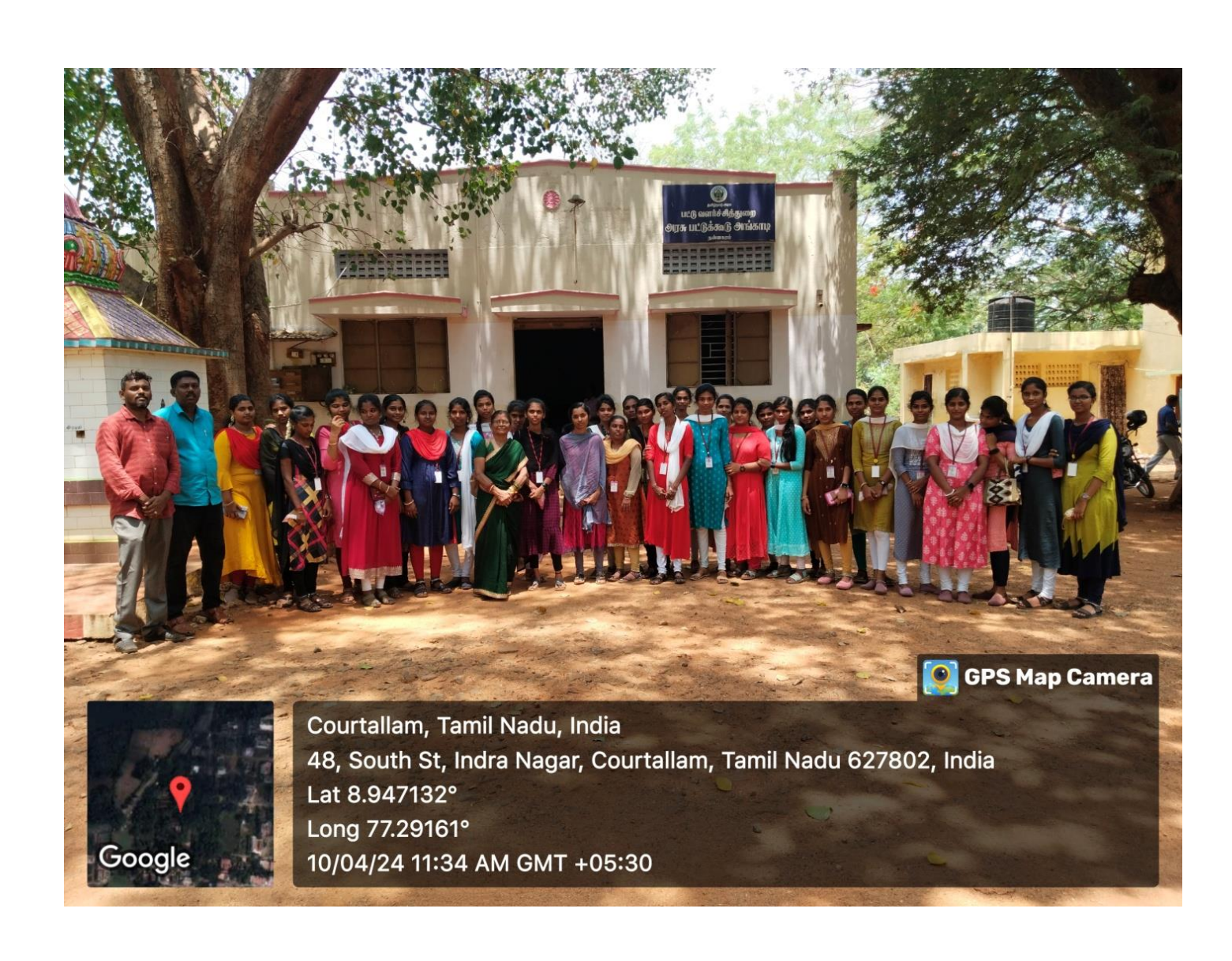
Visit to the department of Sericulture, Silk reeling centre at Nannagaram