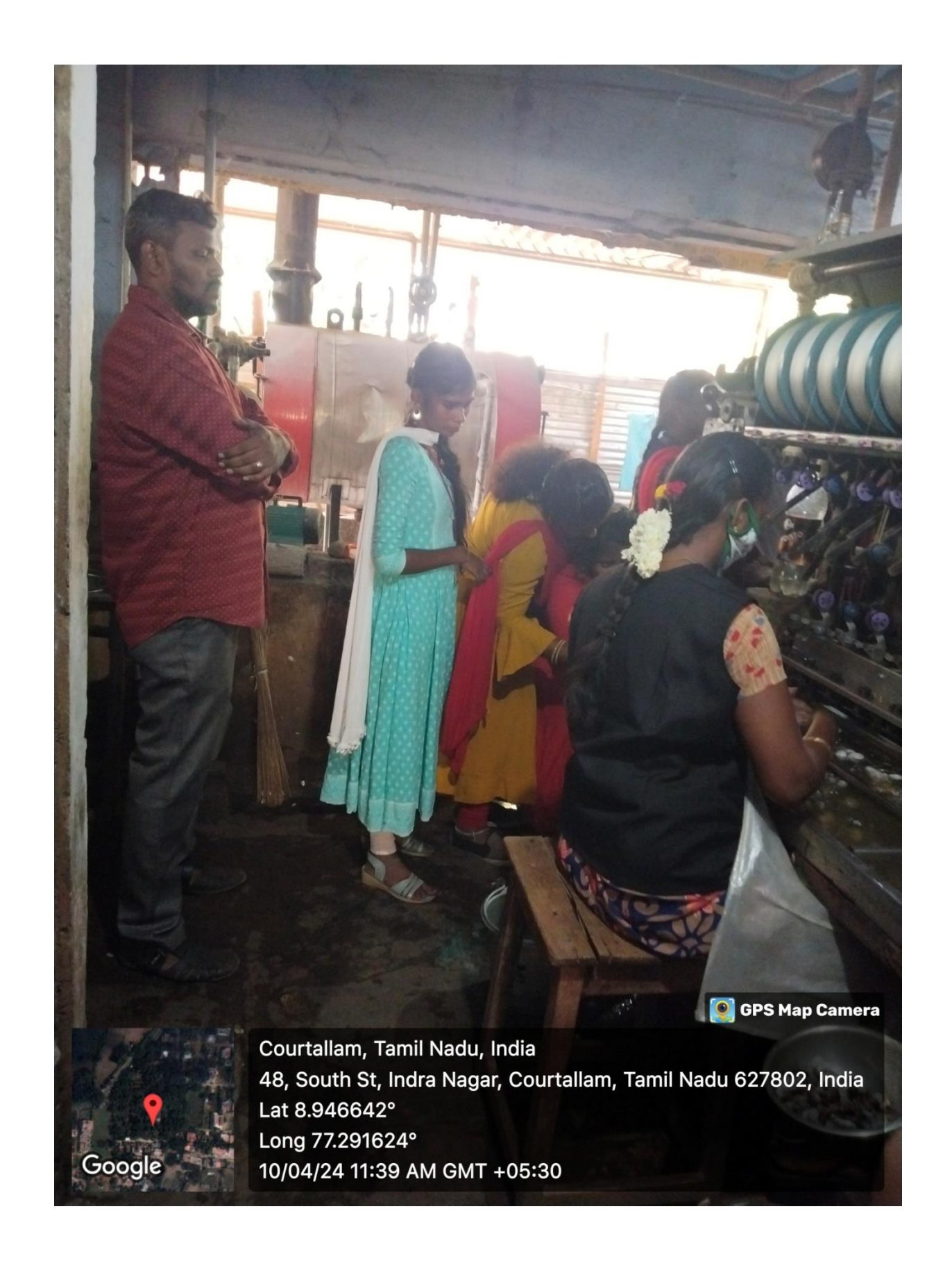
Reeling process of silk thread