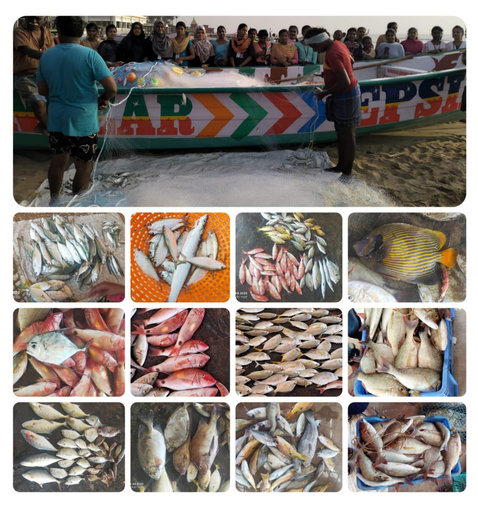
Fishermen at Amalinagar explained the fish capturing process and displayed the variety of fishes